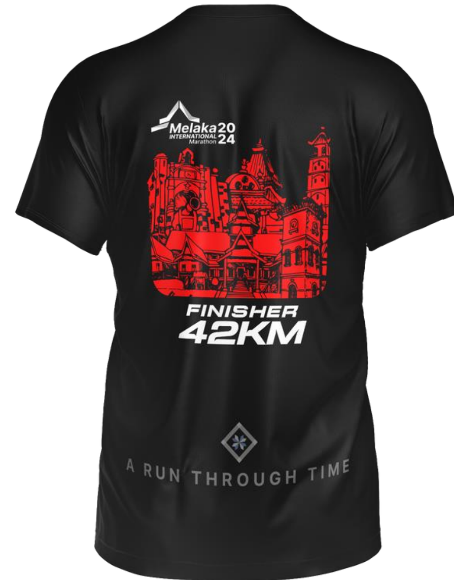
FINISHER TEE (42KM FULL MARATHON/ 21KM HALF MARATHON)