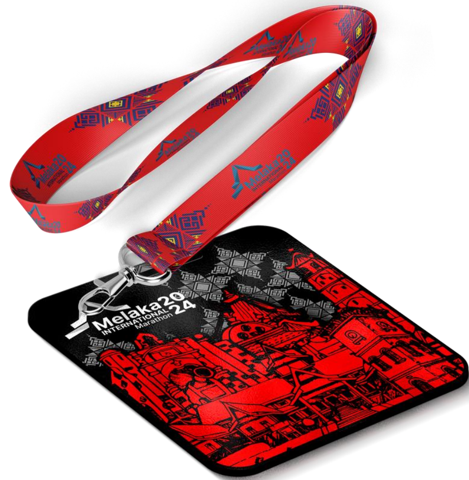
FINISHER MEDAL (ALL DISTANCE CATEGORIES)