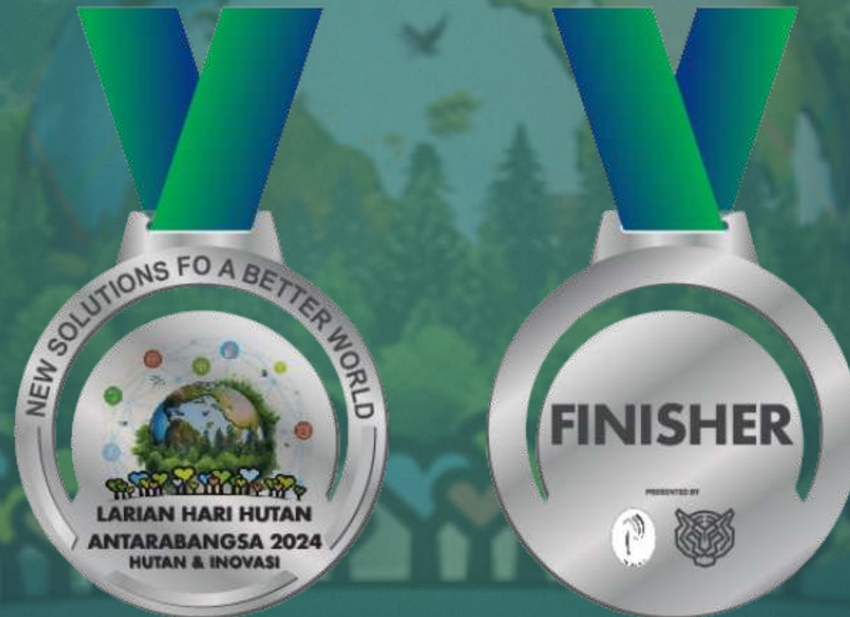
FINISHER MEDAL (5KM & 8KM)

LARIAN HARI HUTAN ANTARABANGSA 2024 HUTAN & INOVASI 5KM FINISHER