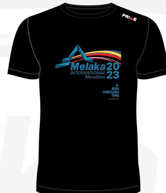
FINISHER TEE (42KM FULL MARATHON)