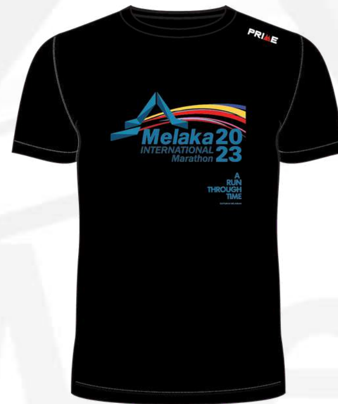
FINISHER TEE (21KM HALF MARATHON)