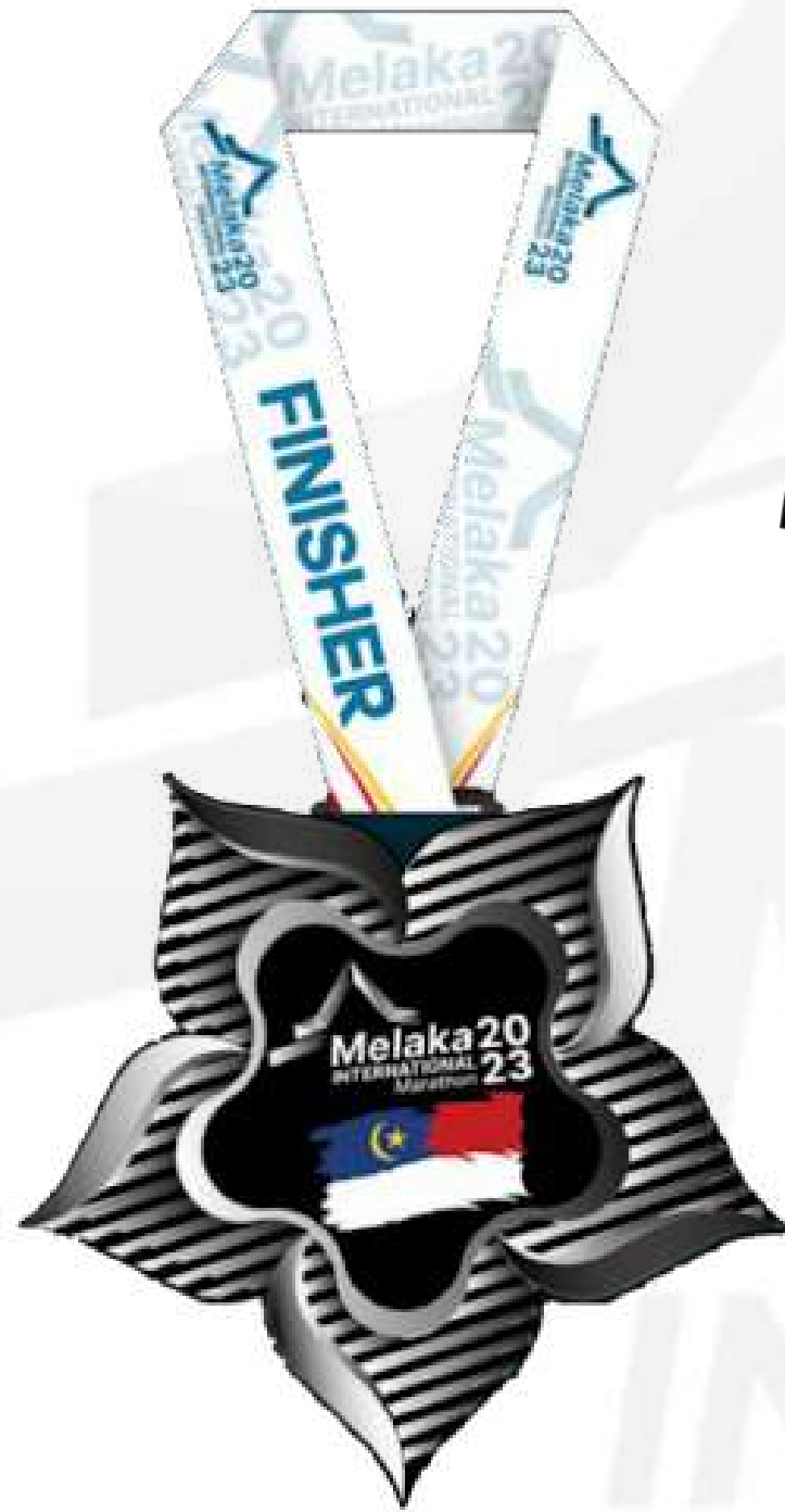
FINISHER MEDAL (ALL DISTANCE CATEGORIES)